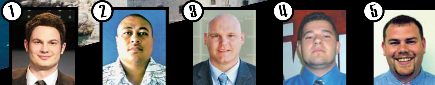
1 RYAN KENDL $5,488 Altig-Orlovic 2 TEVITA TUPOUNIUA $5,244 Steve Friedlander 3 DUSTIN DUNBAR $4,569 Altig-Orlovic 4 BRIAN WELSH $4,469 Simon Arias 5 JOSHUA DISHONG $4,232 Surace-Smith